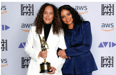
Golden Eddie Honoree Gina Prince-Bythewood with presenter Sanaa Lathan