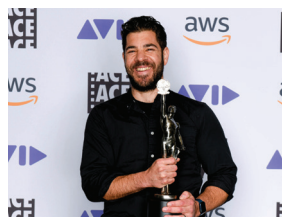
Best Edited Documentary - Non-Theatrical Joe Beshenkovsky, ACE