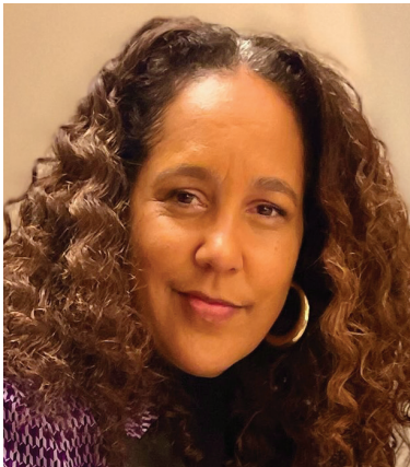
Golden Eddie Honoree Gina Prince-Bythewood